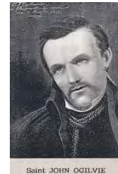
Saint JOHN OGILVIE

Special Mass at 12.15 on Thursday 10 th March to celebrate our Scottish Jesuit Saint.