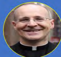
Pope Francis on LGBTQ+ Ministry James Martin SJ Tuesday 9 th March 7.30pm